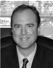
Congressman Adam Schiff 28th Congressional District

On Wednesday, January 22nd at 6 pm, I will be hosting a town hall meeting at the Crescenta-Cañada YMCA to discuss the future of the Rim of the Valley. The National Park Service has already provided a recommendation to Congress to create a San Gabriel unit of the Santa Monica Mountains National Recreation Area. While this is only a recommendation, Congresswoman Chu, who has spearheaded the San Gabriel initiative, will likely introduce legislation in the near future to act upon it.