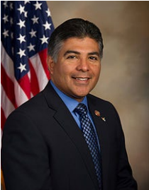
Tony Cardenas Congressman, 29th District

When I raised my hand to take the oath of office last January, to serve as the Congressman for the San Fernando Valley, I did so in Washington. Then I returned home, to the Valley, where I held a Community Swearing-In at L.A. Mission College.