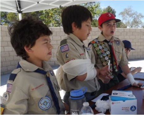
2014 Emergency Preparedness Expo at Hansen Dam co-sponsored by LAPD, LA County Sheriff, LA City Fire and Search & Rescue. The event included the Shakey Quakey Schoolhouse, Boy Scout First Aid exhibits, Family Emergency Communication Plans and more held on March 8, 2014.